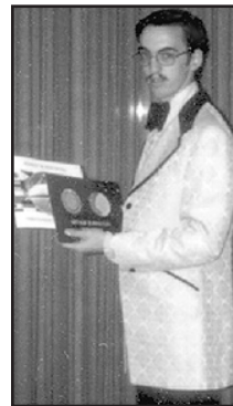
In my tux holding the booklet and program from the Rubinstein concert.